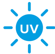
UV LIGHT SANITIZATION